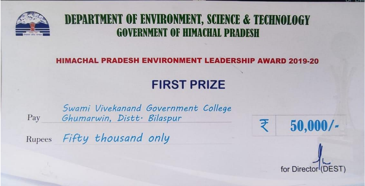
Figure 5 Image of Jumbo Cheque awarded to Institution