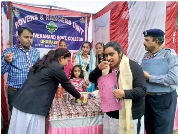
Figure 10 Team inspecting the taste of traditional dishes prepared by our students