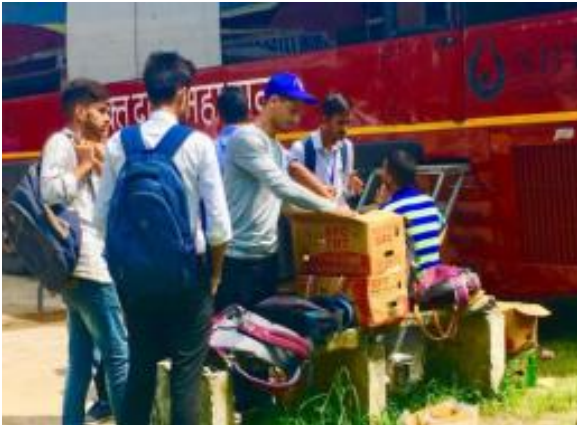
Figure 19 Volunteers in helping hand to Blood Bank team