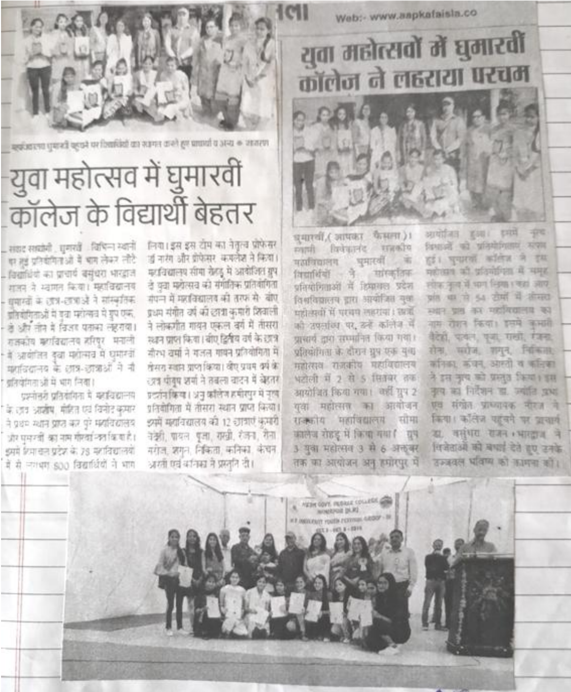
Figure 7 Media Reports