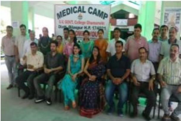
Figure 18 Free Health Camp at Institution