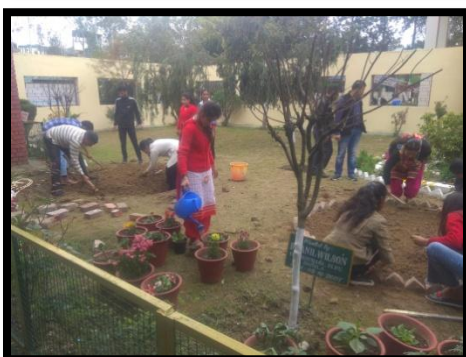
Figure 1 Students and Staff in action during "Swachhata Pakhwada" and "Plantation Drive"