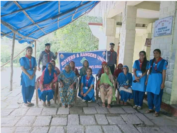
Figure 12 Sensitization regarding Disaster Management at 'Karyalag' by Ranger and Rovers