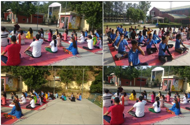
Figure 15 Hostel students in action at Yoga day