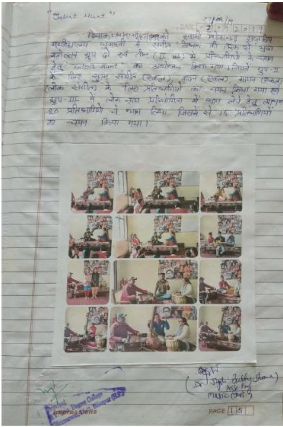
Figure 8 Talent Hunt Programme at Institution Level