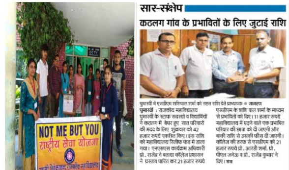
Figure 16 Staff giving donation to local administration for the landslide affected area