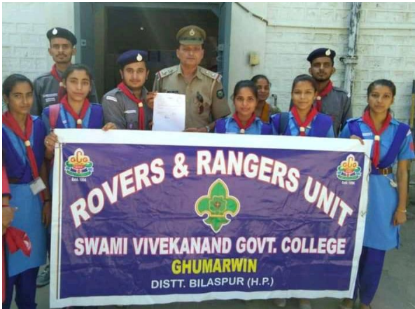
Figure 14 R&R with local police administration