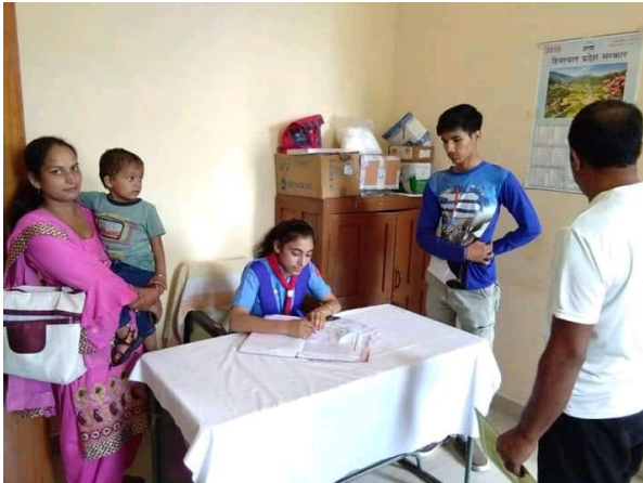
Figure 13 R&R students at Civil Hospital