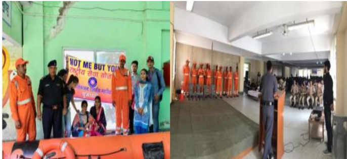
Figure 17 NSS, NCC & R&R volunteers with NDRF team