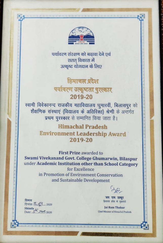
Figure 3 Certificate