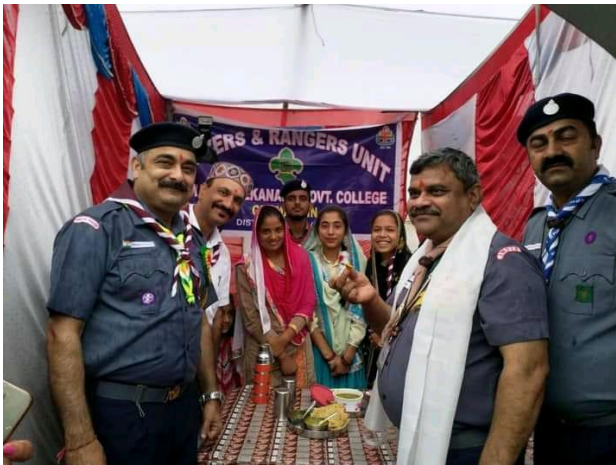
Figure 9 Students interacting with Director Higher Education, H.P. during Moot Camp