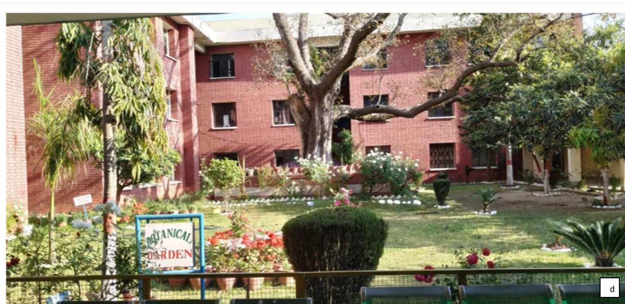
Figure 2 (a, b, c, d) View of Clean and Green Campus SV Govt College Ghumarwin