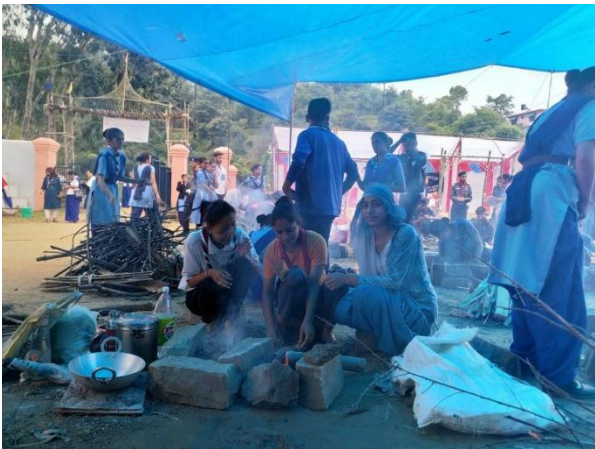
Figure 11 Students showing skill in preparing culinary dishes