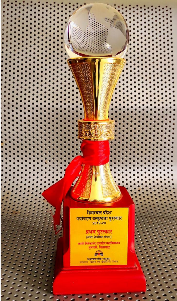
Figure 4 Trophy