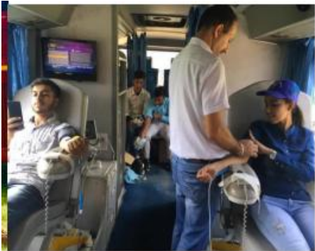
Figure 20 Blood donation camp